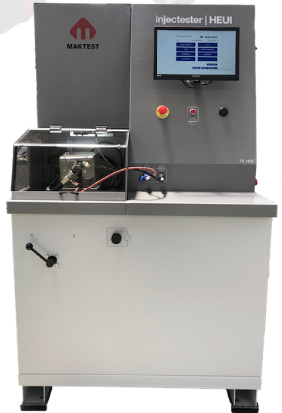
Automatic High Pressure Control

High Pressure : 0-300 bar; Digital Low Pressure . 0-6 bar; Digital Flow Gear Type; 0 - 200 mm 3 /Stroke; Digital Temperature 10- 160 °C; Digital